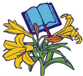
DAILY BIBLE READINGS FOR LENT

One of the best ways to feed your soul during Lent is through daily Bible reading. Our daily Bible readings are in the form of a bookmark that you can take. They're available in the Narthex. They are also listed on the church website ( rm-umc.org ). Click the Lent 2021 button on the front page to get the daily readings. It's never too late to start reading your Bible during the season of Lent.