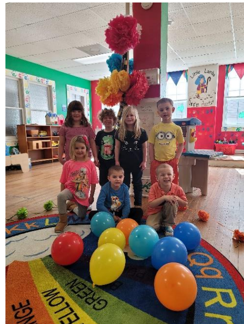
Happy Birthday Dr. Seuss! 4-Year-Old Class