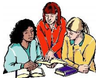
Women's Bible Study

The United Methodist Men will have their breakfast meeting on Sunday September 24 at 8:45 a.m. in the fellowship hall. This is open to Men and spouses and anyone who wants to find out more of what we do in the community. I look forward to seeing everybody!